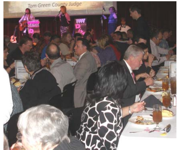
Volunteers and community leaders will be recognized at the Annual Banquet .

More Chamber members attend the Annual Banquet than any other function of the year. The Banquet is expected to sell out again this year, so please make your reservations soon.