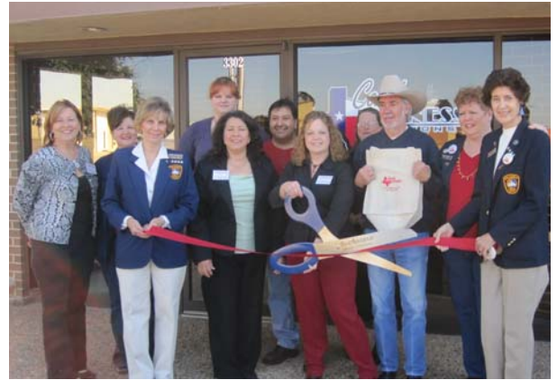
Concho Business Solutions 3302 Foster St. 949-1697