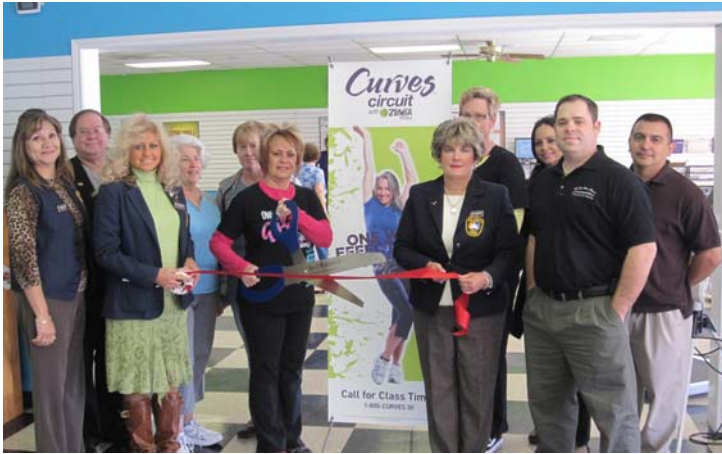
Curves for Women 3544 Knickerbocker Rd. 223-5977