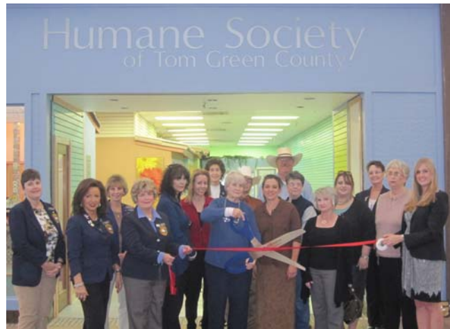
Humane Society 4001 Sunset Dr. (Inside Sunset Mall) 653-8056