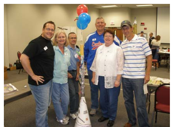
West Texas Training Center