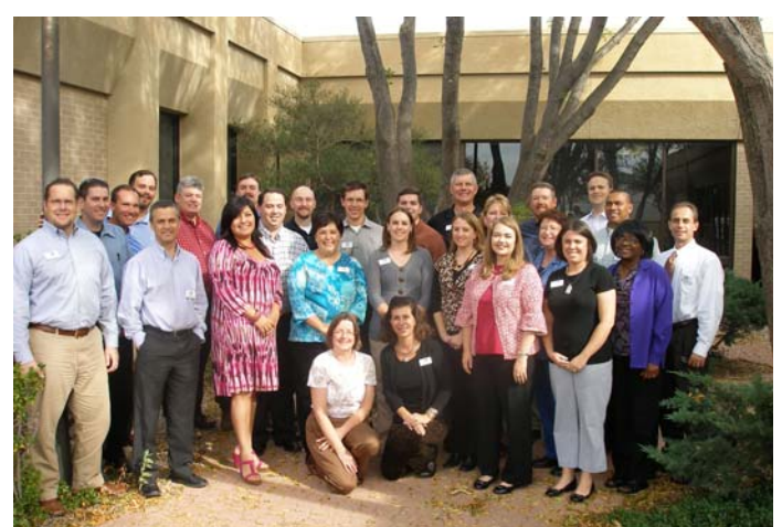
West Texas Rehabilitation Center