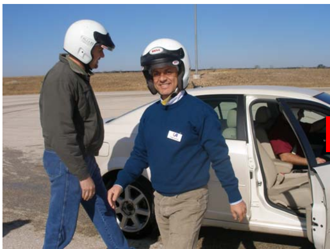
Goodyear Proving Grounds