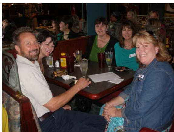
New Class Welcome Reception at Zentner's Daughter Restaurant