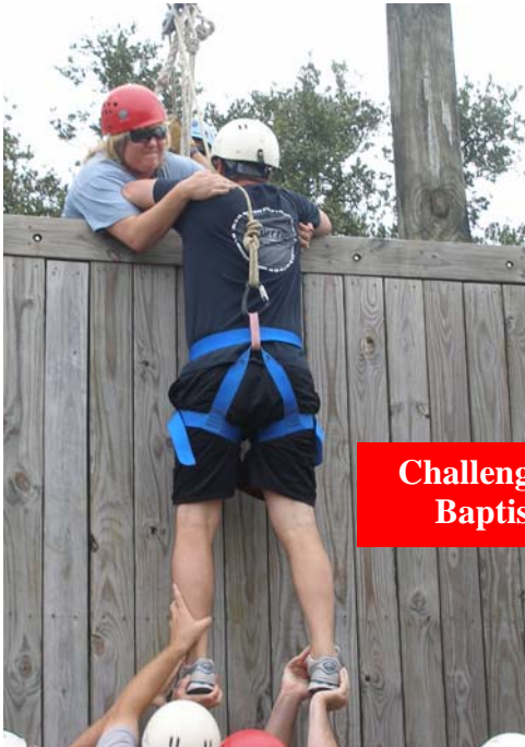
Challenge Course at HOT Baptist Encampment

This month's session puts the current class at half-way through their class year. As you can see from the photos below, they have already visited a lot of community venues.