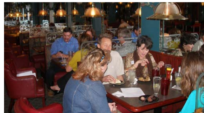
Mixer at Zentner's Daughter Restaurant