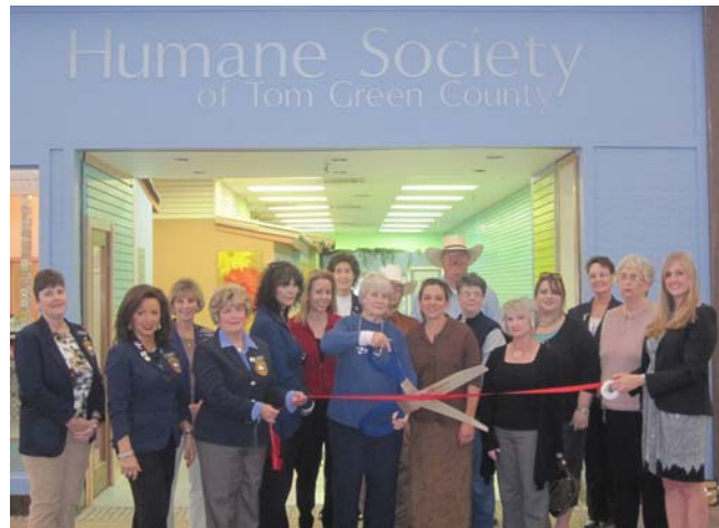
Humane Society 4001 Sunset Dr. (Inside Sunset Mall) 653-8056